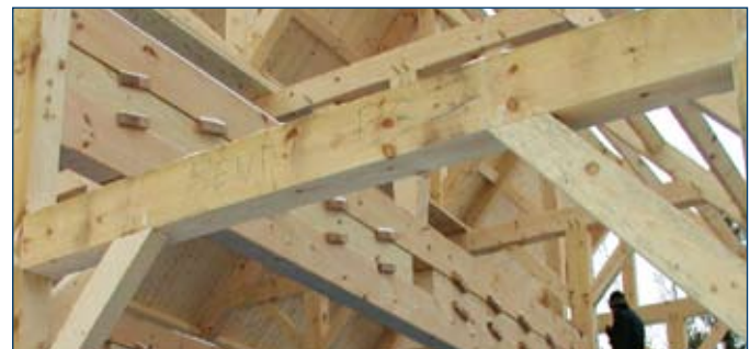
Shown here is a tri-laminate keyed beam that has a designed gap in the center lamina.

For metric tables and more standard configurations, go to the Key-Laminated Beams page on the FraserWood website.