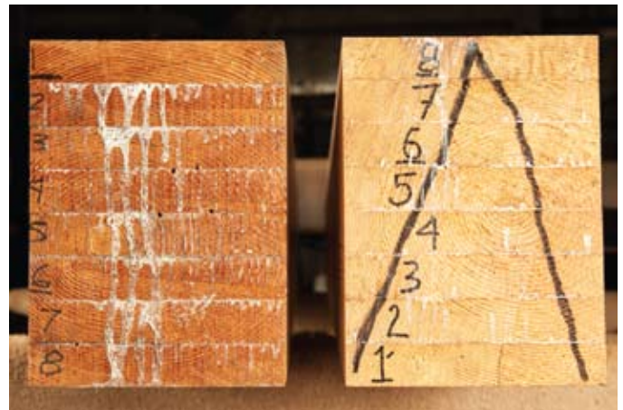
The laminae are numbered before drying then reassembled back into their original order.

Lastly, we stamp the GrainMatched Glulam with the certifying agency mark, confirming to all parties that it meets the project requirements.