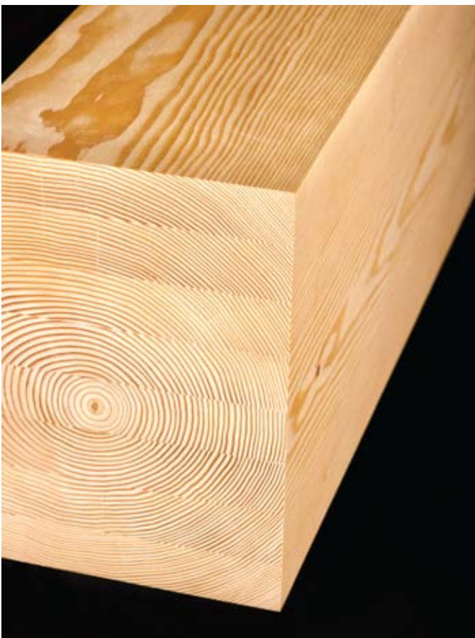
This boxed-heart timber has been turned into a GrainMatched™ Glulam that is rated stronger, dryer and more stable than is possible with a solid sawn timber of the same wood and similar width and thickness.